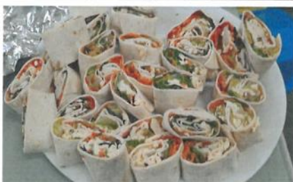
Children enjoyed Veg Wrap in the afternoon Tea.

Looking forward to seeing you all having fun at your OSHC 😊