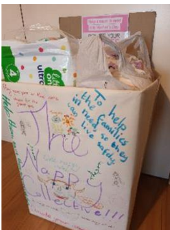
HPS's overflowing donation box.