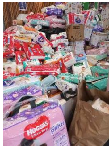
Some of the nappies donated in Melbourne, waiting to be sorted, counted and distributed to families in crisis.